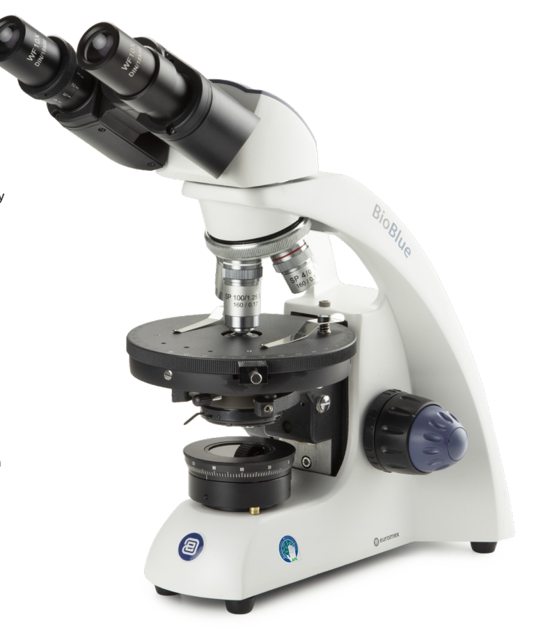
Polarization model BB.4260-P-HLED

APL is a revolutionary paint treatment applied to the most critical parts of our products. A microscope with APL will restrict the growth of micro-organisms, including bacteria and mold