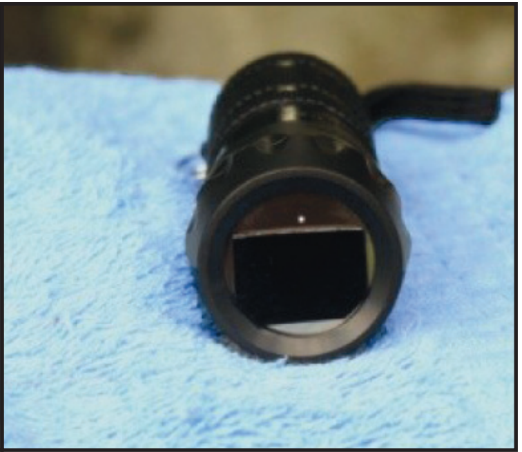
Image 2 - One Star Lit

for collimating my telescopes. This little device is pretty slick. At first glance it looks like nothing more than a little flash light. However, when you look a little closer you realize that it's got 5 really bright LEDs and 5 pinholes of varying sizes, as shown in the "All Stars Lit," (Image 1). You only need to use one of the stars at a time. You choose which opening to use based on the size and focal length of your telescope. The device comes with a small magnetic mask that you place on the front to block all but the one "star" you are using at the moment. You can see the mask in the "One Star Lit," (Image 2).