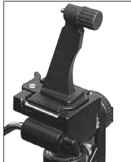
Figure 2. The Versatile Tripod Adapter installed on a tripod head.